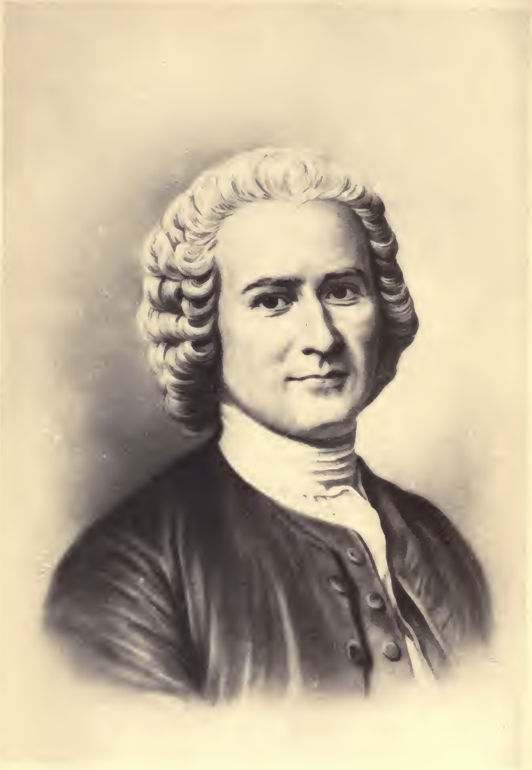
JEAN JACQUES ROUSSEAU.